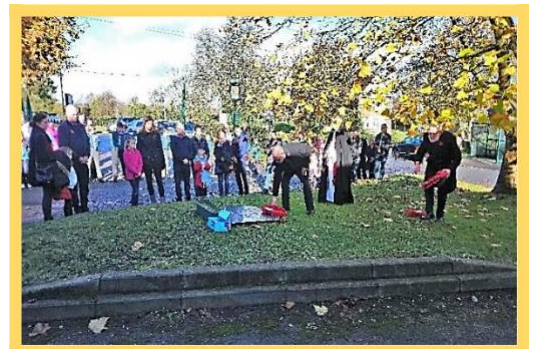
Remembrance Service at the Village Memorial Stone