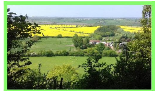
A view from Sharpenhoe Clappers